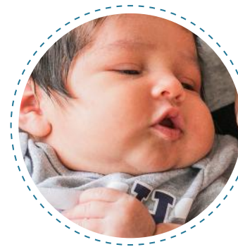
Pucker their lips