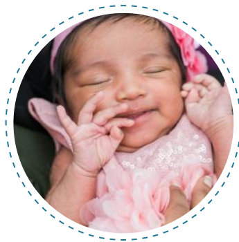
Bend their arms and legs