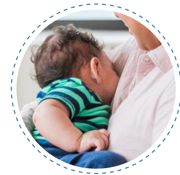
Search for the breast or chest