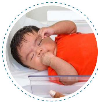
Make sucking noises