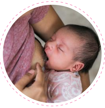
Suck slower or stop sucking