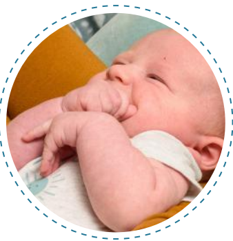
Keep their hands near their mouth