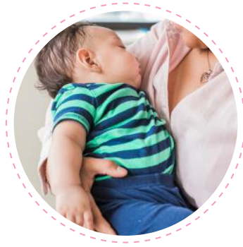
Relax their arms and legs